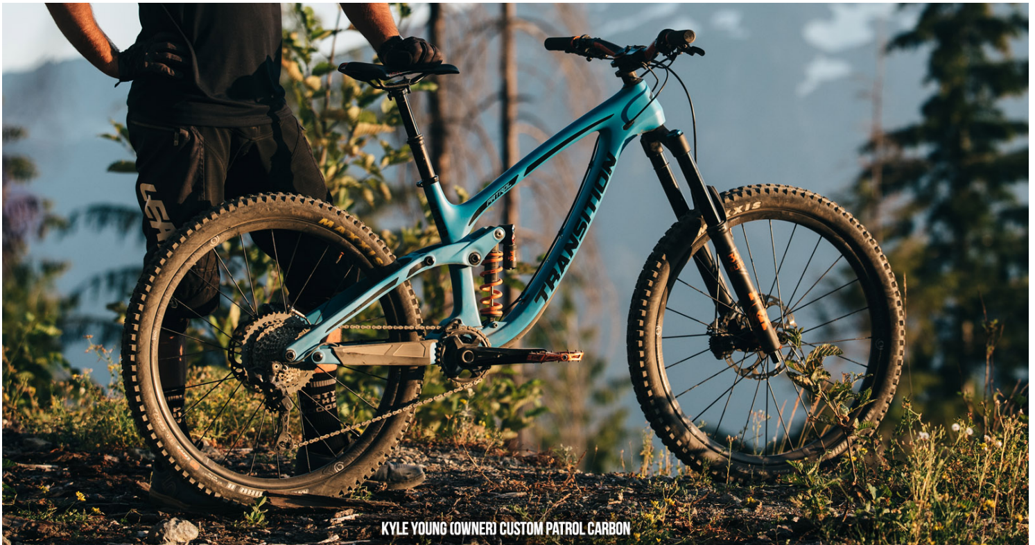
KYLE YOUNG (OWNER) CUSTOM PATROL CARBON